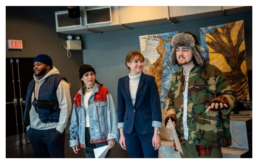
Cast of Mischief/Colonial Park, Neptune Touring Co.

In the program's inaugural year, Arts Nova Scotia committed to collaborate with successful applicants to document their projects as well as host a gathering to exchange learnings and discuss how the program can respond to new challenges and community needs. This feedback will inform how the program can further evolve to serve the artists and community.